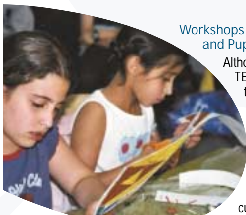
Pesach Workshop at the TALI Frankel School in Jerusalem

Although budget limitations caused TEF to cut back on subsidies to schools for informal educational programs, thousands of TALI parents and children participated in TALI family workshops and pupil seminars, designed to offer experiential, informal learning to supplement TALI curricula.