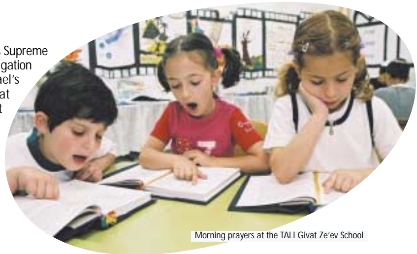
Morning prayers at the TALI Givat Ze’ev School

In a landmark decision in July 2004, Israel’s Supreme Court closed the books on nearly a year of litigation between the TALI Education Fund and Israel’s Ministry of Education. The court ruled that prayer in TALI schools is legitimate, and that the Ministry of Education is obligated to fund instructional hours for prayer in TALI schools to the same extent that it funds the state religious schools. The decision is retroactive to the 2003-04 school year. Twenty-seven of TALI’s 50 schools held daily prayer services in 2003-04, and will therefore receive funding.