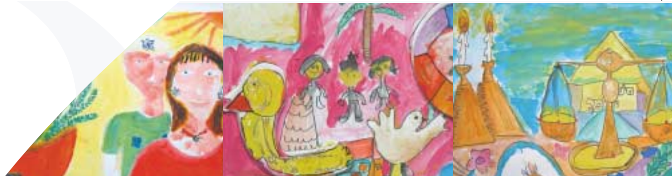
Artwork from the TALI Ben Gurion School in Yavne

Integration of materials Principals in fifteen schools have already ordered 11,000 textbooks for 2004-05. The advanced orders are evidence of an increased level of curricular integration of Jewish studies in TALI schools. TALI textbooks are no longer a luxury, they are a necessity.