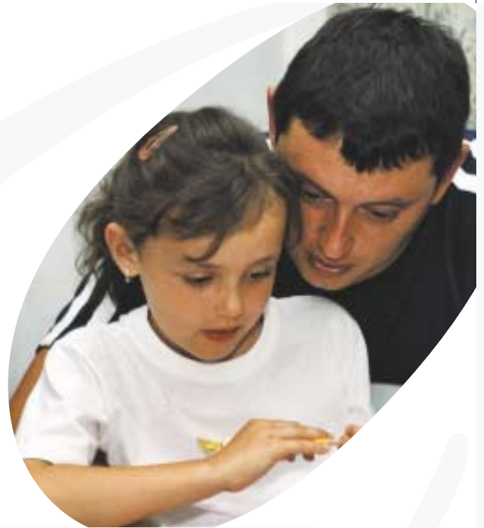
Parent-Child Workshop at Neve Dekalim TALI School, Ashkelon