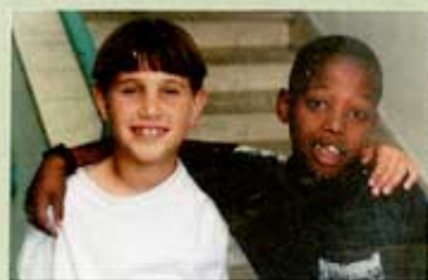
Pupils from TALl Maale Adumim School