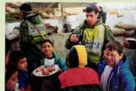
Children of TALI Modi'in school bring food to soldiers guarding near their town.

All seminars and workshops will be combined into one TALI Experiential Jewish Education Center, with a full-time coordinator, who will oversee all staff recruitment, training, implementation and development.