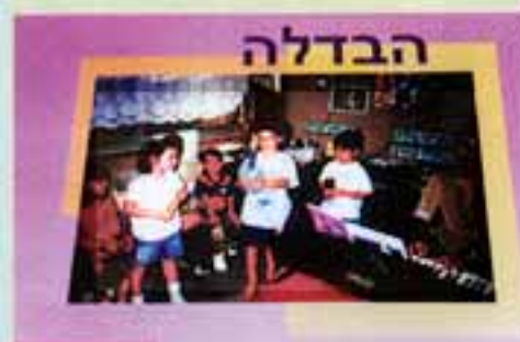
Havdalah service for TALI kindergartners