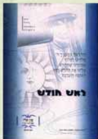
Curriculum Kit on "Rosh Hodesh"