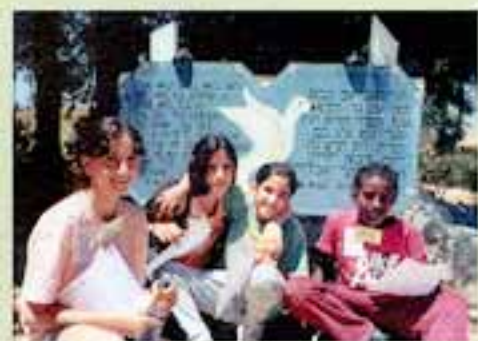
Seminar at Pinat Shorashim, Kibbutz Gezer.