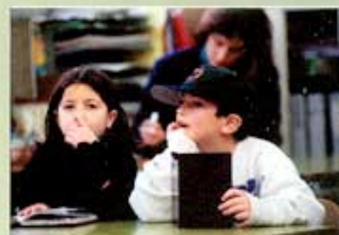
Children from the TALl Frankel School, chosen as Israel's outstanding elementary school for 2001.