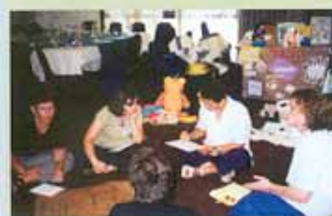
National TALI Kindergarten Teachers' Seminar in Jerusalem.