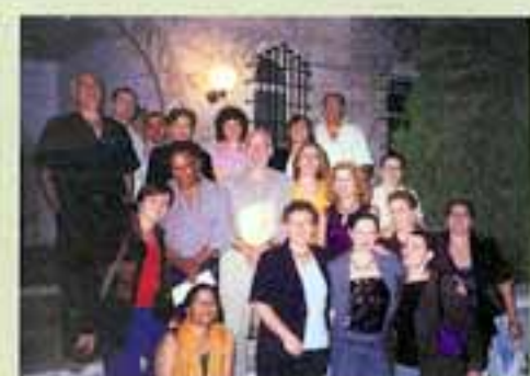
"Learning Community" parents and teachers of Jerusalem's Pisgat Ze'ev neighborhood.

Project coordinator and TEF pedagogic counselors follow up the production of each unit with workshops in the field, to help teachers implement in the classroom. The kits also received very positive feedback by non-TALI secular schools, a number of which have ordered them and are integrating the material into their curricula.