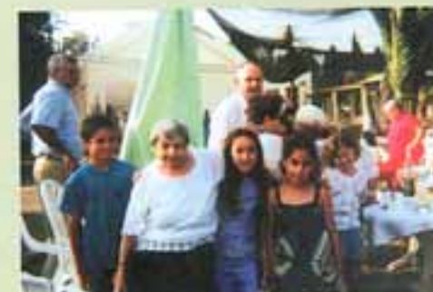
"Adopting Senior Citizen" project at TALI Alonim School in Hadera.

A new program for principals seeking to study Jewish texts relevant to TALI curricula, will begin in the fall of 2001-2002. Groups of 4-5 principals will meet with a mentor once a month for a day of studies. One group will study the subject of "prayer," while the second group will learn "Jewish school curricula." A third group is being organized around the subject of "Jewish environmental education."