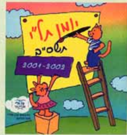
TALI Weekly Torah Portion Diary

For years, TEF has been producing weekly portion sheets for all TALI schools. The sheets have become an integral part of the TALI curriculum. In 2000-2001 TEF produced and distributed 12,000 weekly portion sheets to students and teachers in 350 TALI classrooms. Toward the coming year, TEF is preparing a new format for the worksheets for students in grades 4-6. The new format is a daily diary that integrates the contents of the weekly portion sheets (including weeks when children are on holiday) with a day-by-day diary that highlights the cycle of holidays and events in Jewish History. Suggestions have arisen for translating both the curriculum kits and the weekly portion diary into English. The translation and distribution of these materials to teachers and students could lead to projects connecting schools in Israel to Jewish schools in the Diaspora.