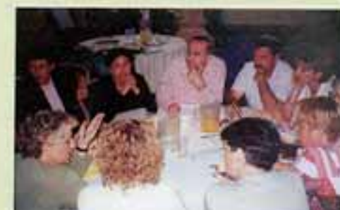
TALI Principals' Center Annual Conference in Jerusalem.