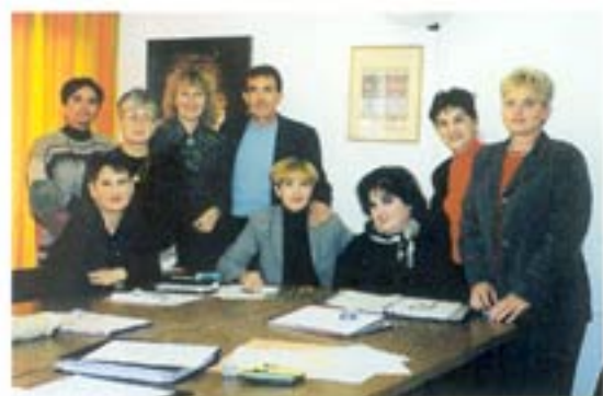
TALI principals in Educational Leadership Program.