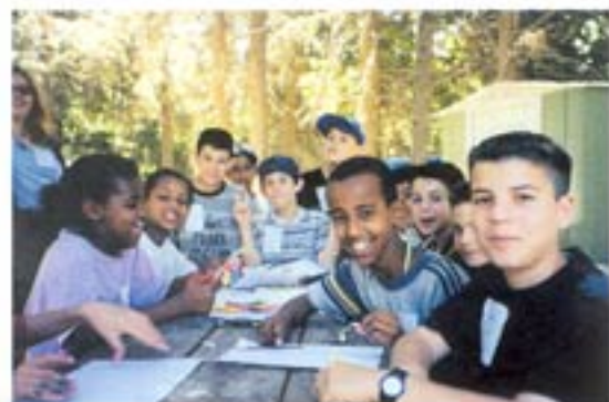
TALI students enjoying a day of fun and Jewish learning at Pinat Shorashim, run jointly by SIJS and Kibbutz Gezer.

Delegation Exchange. In February, the TEF hosted a delegation of New York Jewish educators in Jerusalem, focusing on "The TALI Education Fund and Jewish Identity." Similarly, a mission of Israeli TALI educators travelled to New York to meet with colleagues and partnered schools.