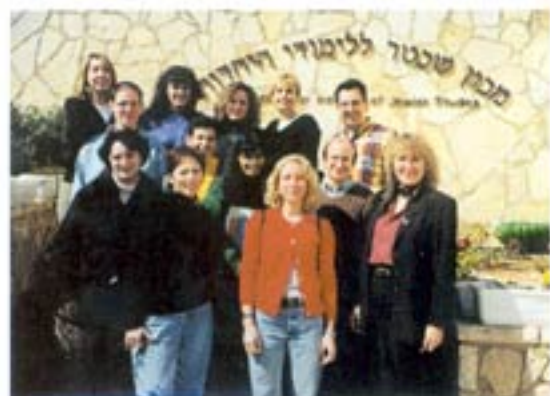
New York Jewish Day School educators are the guests of the TALI Education Fund in Jerusalem.